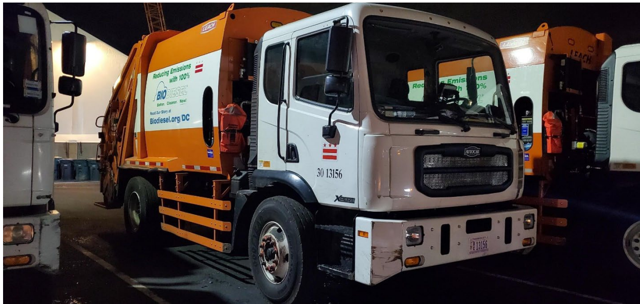
New DC Department of Public Works B100 Refuse Haulers.

end of this year, replacing 90% of fossil fuels and resulting in a substantial 74% cut in CO2 emissions. This work has inspired subsequent grants and sparked discussions at influential forums. These conversations emphasize biodiesel's crucial role in addressing environmental justice and in propelling the biodiesel movement on a national scale.