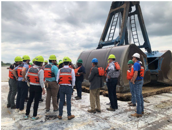
Participants visit a River barge in New Orleans to learn about the handling of feedstocks for biofuel production.

Offering a range of experiences, the tours addressed the staffers' diverse interests. One participant found, "the 'Clean Fuels Health Benefits Study' [Trinity Study] was extremely useful in illustrating tangible ways to lower our emissions and help communities in the short-term." The boat tour of the Port of Long Beach was especially well received leading one staffer to observe, "It was both interesting and tied to a number of federal programs, and the work of the industry and environmental justice." Another staffer noted that, "As the clean fuel industry continues to grow, it is important that job creation grows along with it." Lastly, one participant emphasized the significance of these experiences, stating, "I believe in-person experience within the industry is essential to the work we do as staffers on the Hill because we get a first-hand look at how the policies we make are impacting the public and private sector."