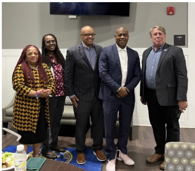
The Newark, NJ mayor and GWRCCC Executive Director, second and third from right, were among those attending the community outreach event in Newark this past fall.