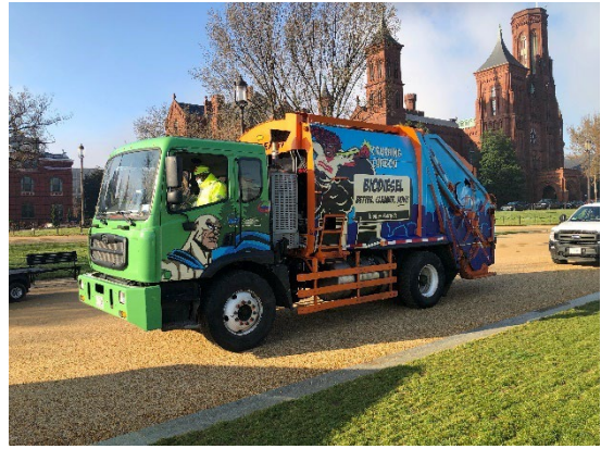
District of Columbia B100 vehicle

transportation and reduced emissions. Targeting vehicle replacements, the project has achieved success moving toward the deployment of 24 new utility vehicles and removal of 42 heavy polluting vehicles. The project will continue until 2025. However, its impact continues to grow. This grant sparked a movement, leading to more B100 (100% biodiesel) vehicles in the region. Nearly 200 of these vehicles will be on the DC roads by the