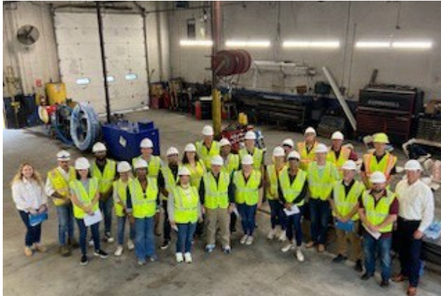
Tour members visit a used cooking oil plant at Darling Ingredients/Valley Proteins in Baltimore, MD.

When Congressional staffers visit field sites, they want information that cannot be learned sitting in a DC office. The annual Congressional education tours, hosted by the Foundation, provide just that. In 2023, a combined 42 Congressional, EPA, USDA, and NREL staff visited nine major biofuel facilities in New Orleans, Maryland, and Los Angeles receiving an overview of the industry from the farm to fuel production all the way to end use. Tailored to the