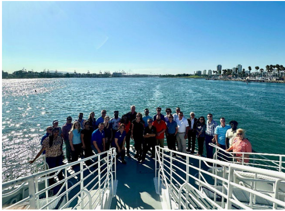
Staffers get a view of the Port of Long Beach's "Green Port" outside Los Angeles, CA where the largest volume of containerized cargo in the nation is handled.